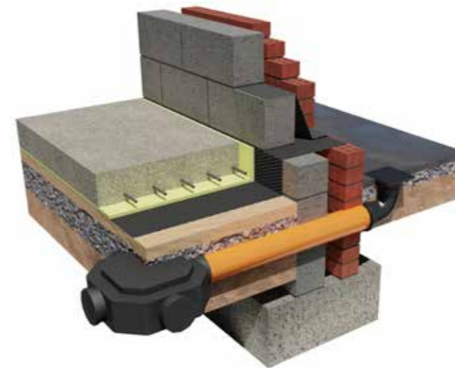
Radon Sump Suspended Slab-residential schematic.

With the ever-increasing demand for new houses and the ever-decreasing availability of suitable greenbelt land, developers are looking to reclaim previously used land, utilising the space beneath our feet with basement constructions. This has led to an increase in competition for the sourcing and use of brownfield sites which are popular candidates for land development. These sites can present challenges in the form of ground pollutants, particularly in a densely populated country like the UK and our industrial heritage.