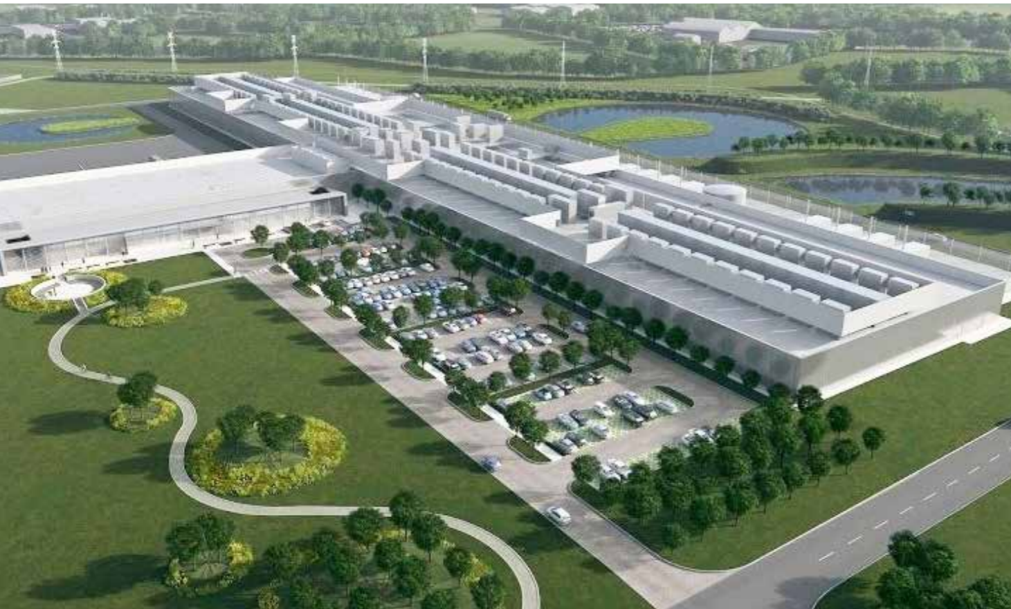
Facebook first data centre.