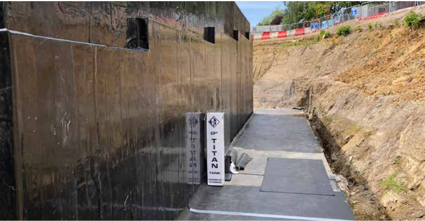
Waterproofing gas membrane.

“This leads to a ‘copy and paste’ culture from previous specifications, which can be the cause of considerable issues further down the line.”